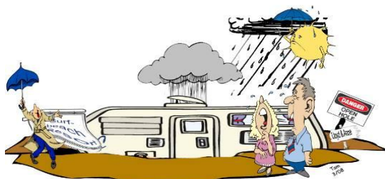
"Look on the bright side...at least the site's level"