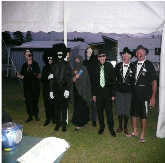
Dress up night