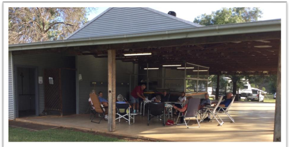
Back for Happy Hour a little late, but we were due a drink and some relaxation! Note the great undercover facilities. The left of the picture has the disabled bathroom and ladies. The middle section is a kitchen and there is a gents bathroom at the other end. We had plenty of room at one end of the area for the 14 of us to sit comfortably.