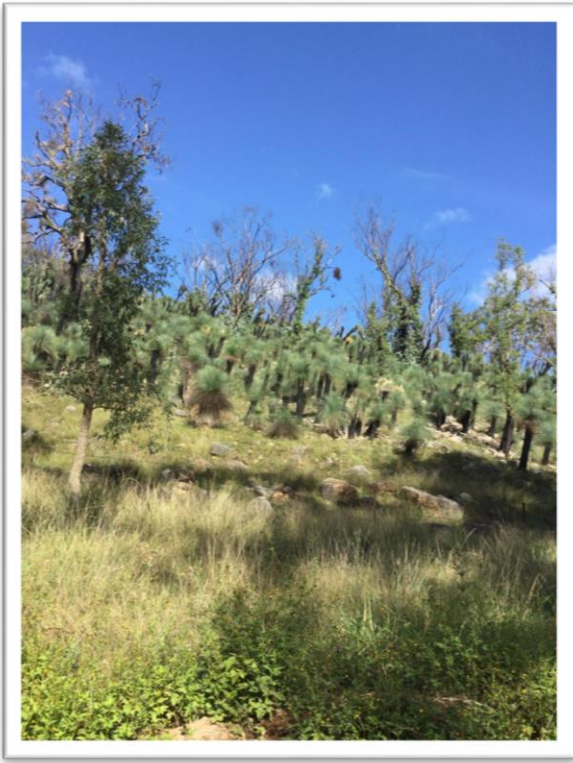
One of the features of the limestone ridges on the Timor – Crawney Pass route is the forests of “grass trees” which pop up along the road