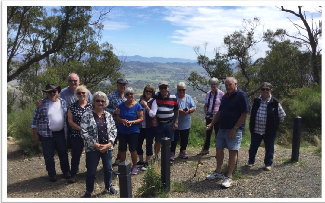
Most of the group at Hanging Rock Lookout

The return home was via Hanging Rock Lookout, Sheeba Dams, Barry Station, Glenrock Station and Ellerston. Some very interesting driving with over 20 water crossings, the boys had great fun. Some of the ladies – not so sure!